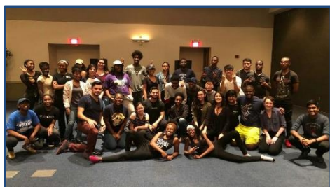
JUST A PORTION OF THE STUDENTS WHO ATTENDED STEPPIN' TO SALSA